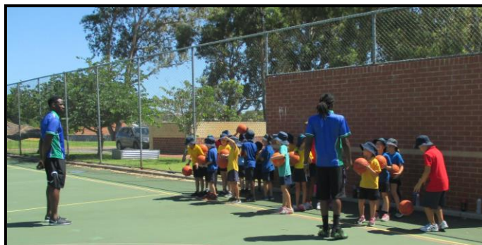
Basketball Clinics through Senators Basketball