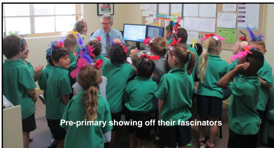
Pre-primary showing off their fascinators

The final Yuluma PS Board Meeting for the year will be held on Monday 20 th November and is open for viewing to any parent of the school. Should you wish to attend the meeting as an observer please indicate to the principal, prior to the meeting day.